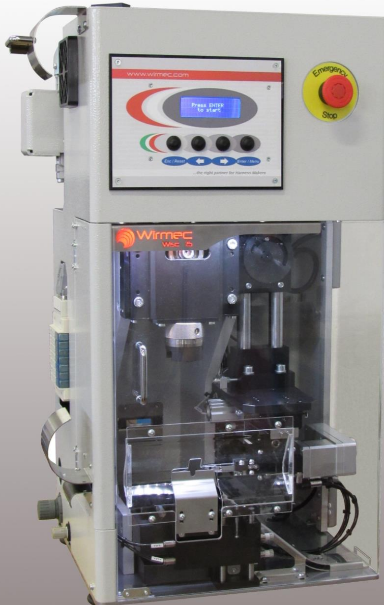
Wsc 15 Electro pneumatic stripper crimper