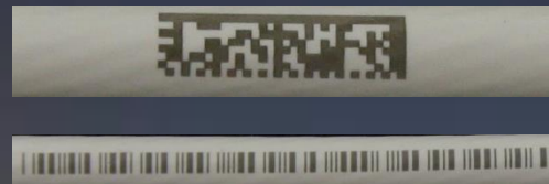
Above: Linear barcode and 2D data Matrix machine readable codes

This system offers completely flexible marking, with unlimited character sets, variable font sizes and the ability to mark upper and lower case characters, as well as linear bar code, e.g. BC39, and 2D data matrix machine readable codes.