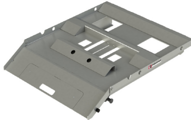
Fig. 2: TROMSTOP, loading ramp told out